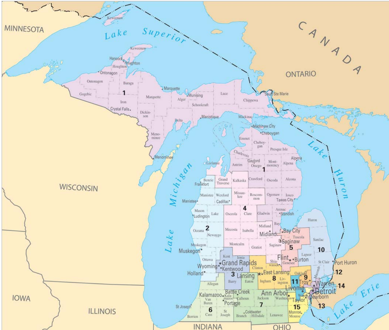
Map: National Atlas of the United States of America